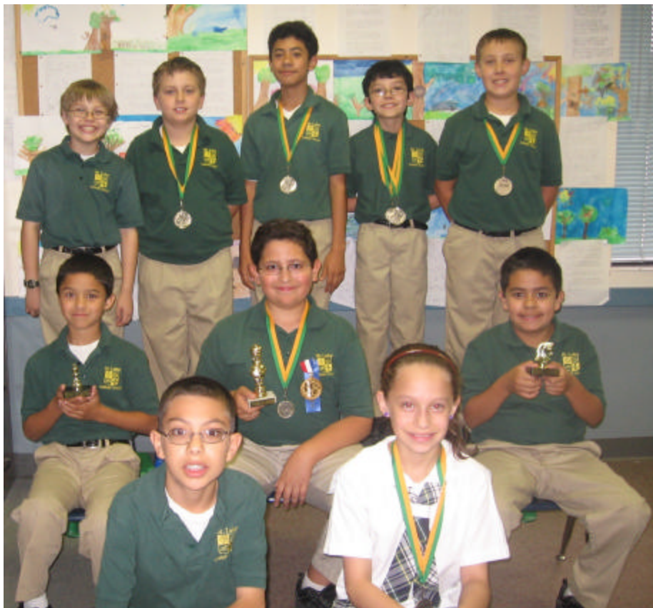
2009-2010 Chess Club